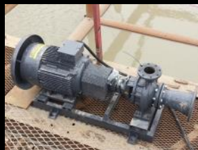
Water Jet Pump