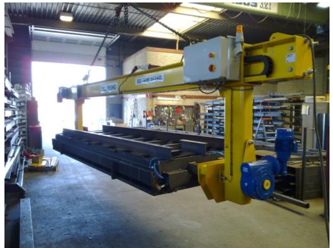
Overturn lifting beam