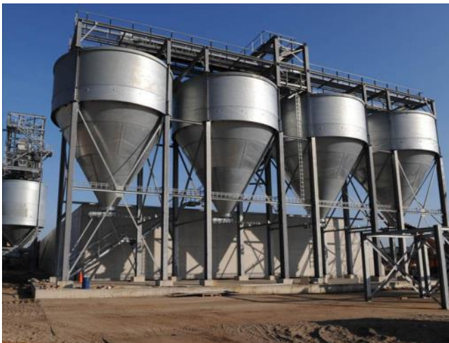
Sand separation plant