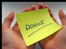
Advice and support