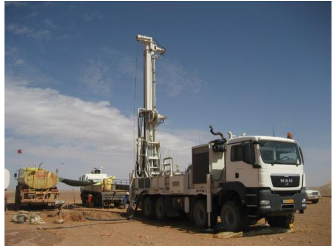
Mobile drill rig