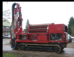
Drill rig crawler