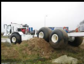
Wheel Buggy 6x6